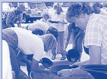
One of the favorite hands-on activities is panning for gold.

The concluding event of the My Earth—Our Home partnership will be a booth and double information session at the Nevada State Science Teachers Association Convention in Las Vegas, November 2-4, 2001.